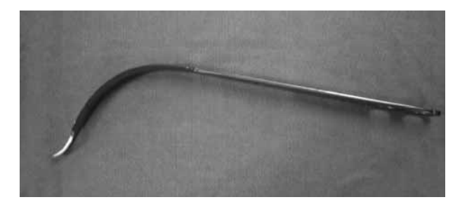
Fig. 4. — An over aggressive Hohmann-type retractor can cause neurovascular injury.

more than 55^{\circ} (55 – 72). This translated into an increased risk of dislocation (1) which means that the benefit of using large heads was lost (12). In addition, a cup which is excessively vertical will encourage conflict between the neck and the lower edge of the cup in adduction of the hip, with a risk of metallosis in the short term. This excessive cup abduction angle is facilitated by a defect in acetabular coverage (1) in dysplastic hips, but also by the approach used because of the distal part of the scar and of the proximal femur levering on the cup holder. Moreover, they encourage elliptical drilling by a leverage effect on the instrument handles, which compromises the primary stability of the implants. Traction along the axis of the leg together with the use of curved instruments will facilitate acetabular preparation and insertion of the acetabular implant.