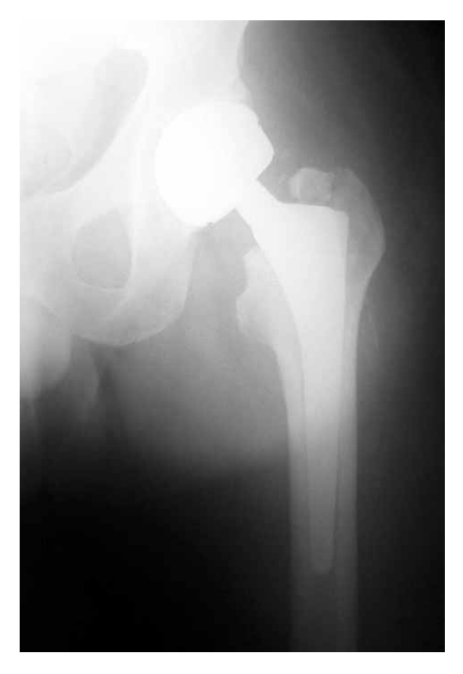
Fig. 1. — Immediate postoperative pelvic radiograph : AP view showing displaced fracture of the greater trochanter.