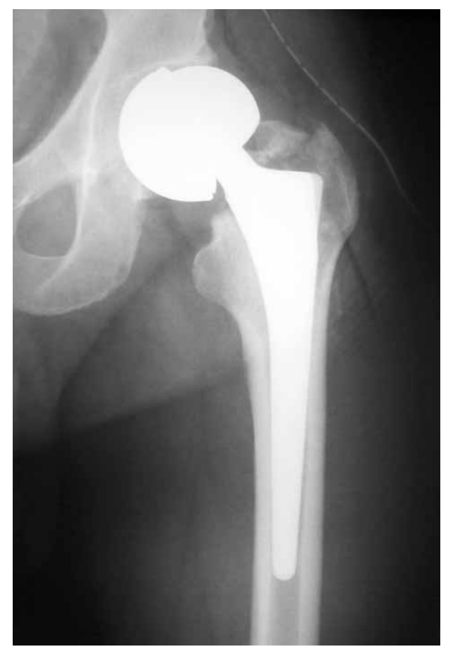
Fig. 2. — Immediate postoperative radiograph (AP view) showing tilting of the metal back Repeat surgery was performed immediately before departure from the operating room. There was also a fracture of the greater trochanter.

imally invasive procedure (11) because it is easier to progressively reduce the length of the incision while using the usual approach. This decreases the risk of complications, even though they still exist (32). Some authors have demonstrated (8) that early functional results are not affected by the learning curve in their experience. Our study confirms this. However, the experience of a surgeon in relation to a given technique is a significant variable for the quality of the surgical intervention (2, 8, 17). This is even more true when learning the minimally invasive approaches (2). There are new anatomical landmarks, a reduced operating field, and differences in terms of dissection and exposure which require