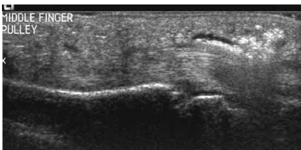
Fig. 2. — Showing the site of steroid injection around the flexor sheath in the region of the A1 pulley.

Xylocaine is injected subcutaneously. The patient is further assessed by ultrasound and a suitable entry point is marked. Skin is prepared with Chlorhexidine or Betadine. The area is isolated with a holed drape and further procedure carried under strict aseptic conditions. A 27-gauge needle is used. The surgeon, under further ultrasound guidance advances the needle to check its position with respect to the sheath and the A1 pulley (fig 2). When the needle is placed correctly within the