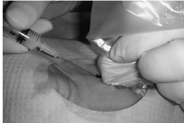
Fig. 3. — Steroid injection under ultrasound guidance after localising the entry point.

Xylocaine is injected subcutaneously. The patient is further assessed by ultrasound and a suitable entry point is marked. Skin is prepared with Chlorhexidine or Betadine. The area is isolated with a holed drape and further procedure carried under strict aseptic conditions. A 27-gauge needle is used. The surgeon, under further ultrasound guidance advances the needle to check its position with respect to the sheath and the A1 pulley (fig 2). When the needle is placed correctly within the