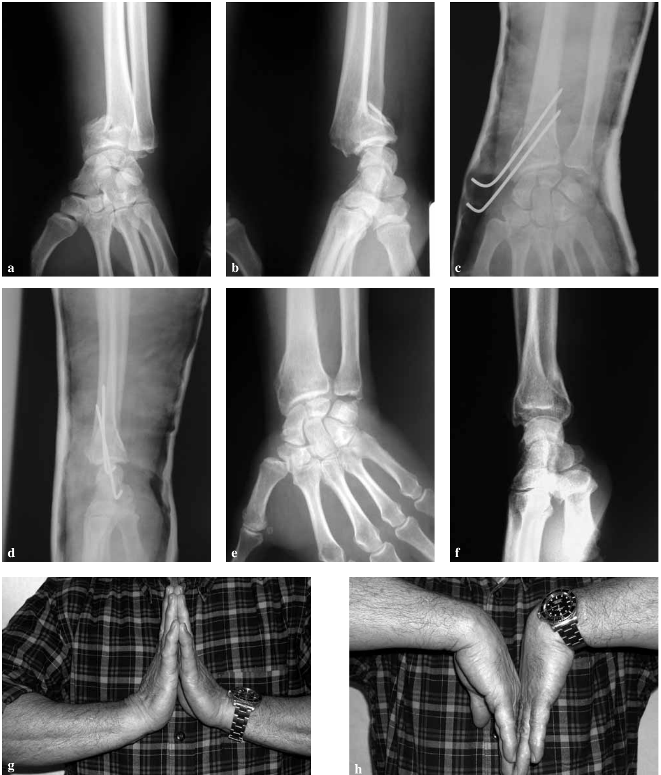
Fig. 3. — TS, 57-year-old white male : a, b ) type 2 wrist fracture according to Frykman ; c, d ) percutaneous pinning according to Crenshaw/Mah was performed, healing was achieved 5 weeks later ; e, f ) Radiograph 1 year later, with adequate restoration of all radiologic indices ; g, h ) excellent functional result.