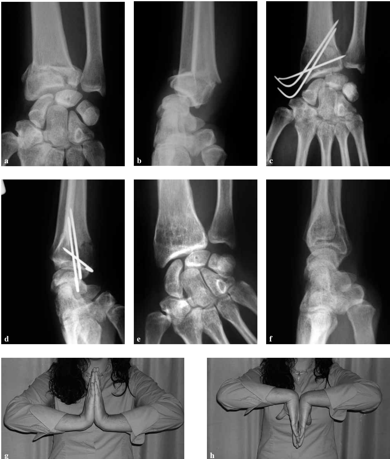
Fig. 4. — DGS, 28-year-old white female : a, b) Frykman's type 3 fracture at the wrist ; c, d) intraoperative radiographs ; e, f) radiograph one year later ; g, h) excellent functional result.