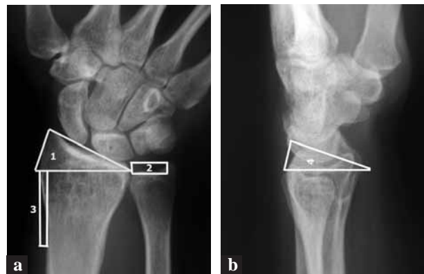
Fig. 2a, b. — Radiological indices assessed for this study 1. Radial tilt 2. Ulnar variance 3. Radial translation 4. Volar tilt

An analysis of these 21 poor and fair results shows that 10 were open fractures or were associated with other bone fractures, which interfered with rehabilitation after removal of the cast.