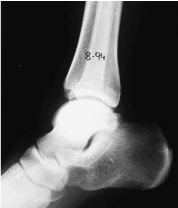
Fig. 1. — Lateral radiograph suggesting osteochondritis of the talus.

according to Enneking's staging system (7) as a stage IIB primary malignant tumour.