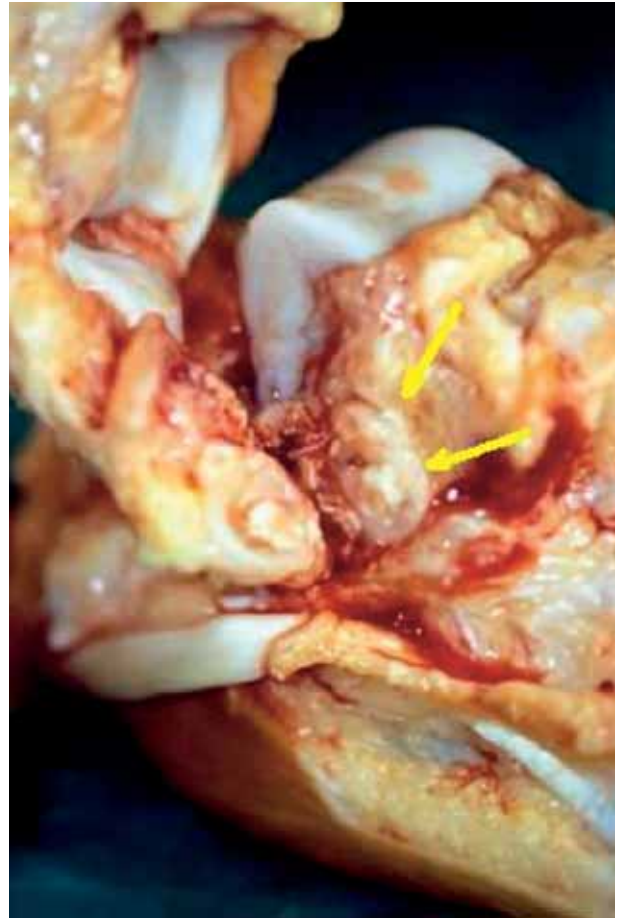
Fig. 4. — Macroscopic image showing extraosseous invasion (arrows).

symptoms and correct diagnosis. This time interval, which ranges from 6 to 48 months, with an average of 28 months (3), is longer in osteosarcoma of the talus than in conventional osteosarcoma (5), in which the diagnosis is frequently made within a few months of symptoms onset. Typical radiological signs can be found in the long bones but not in the talus (9).