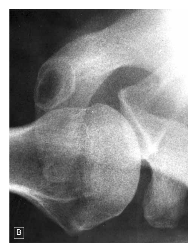
Fig. 1. — (A) Anteroposterior and (B) axillary radiographs showing a well-circumscribed osteolytic lesion with sclerotic borders located at the posterolateral acromion and extending inferiorly to the subacromial space.

T2-weighted gradient-echo images. The subacromial fat was completely obliterated, and the rotator cuff tendons had normal appearance and intensity, but the acromial surface of the infraspinatus was deformed due to compression (fig 3). The patient was diagnosed of shoulder impingement secondary to extrinsic compression of the rotator cuff by the lesion localised at the acromion, and surgery was scheduled to relieve the infraspinatus tendon excursion by excising the mass.