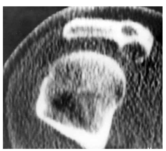
Fig. 2. — CT-scan confirmed the cystic appearance of the lesion.