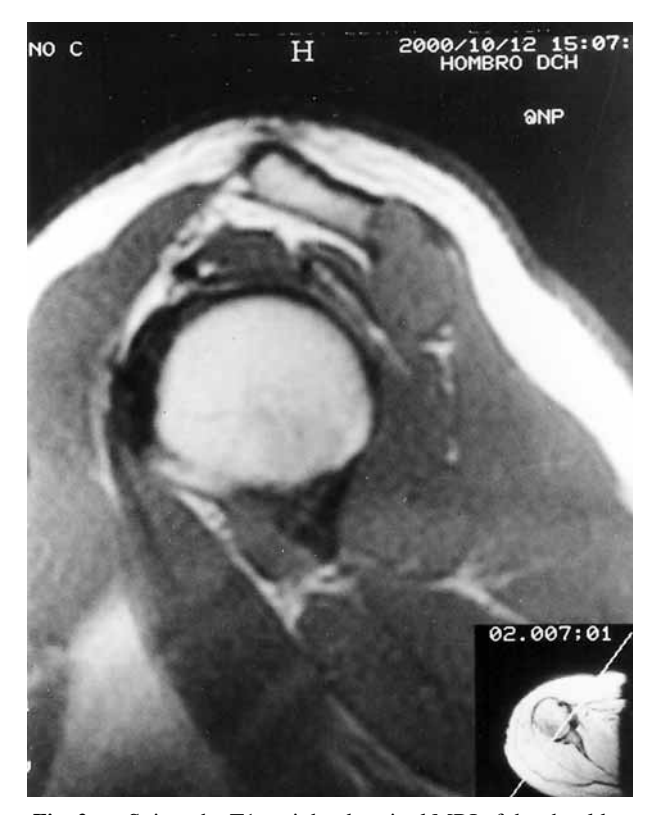
Fig. 3. — Spin-echo T1-weighted sagittal MRI of the shoulder. The tumour extended inferiorly from the acromion, and occupied the posterior area of the subacromial space, obliterating the fat and deforming the infraspinatus tendon.