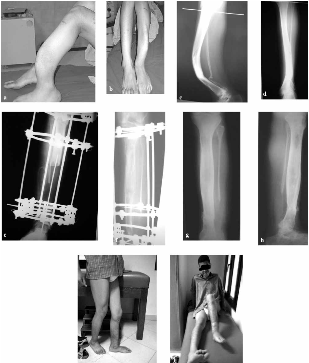
Fig. 2. — A 15 year-old-boy with anterolateral bowing of the left tibia ; a-b) Pre-operative photograph of the patient's leg ; c-d) AP and lateral radiographs demonstrate anterolateral bowing of the left tibia, Crawford's type II lesion ; e) A complete excision of the affected bone segment was done ; f) Follow-up radiograph at final follow-up ; g-h) The deformity is corrected radiologically ; i-j) Clinically.