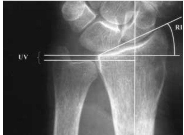
Fig. 2. — Measurement of ulnar variance (UV) and radial inclination (RI).

correlation. The Mann-Whitney U test was used to look for differences in clinical and radiological outcome between patients younger than 66 years and older than 65 years, between patients with a fracture at the dominant and non-dominant side, and between intra-articular and extra-articular fractures.