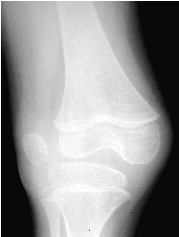
Fig. 1. — Radiograph of right knee of the patient with Down's syndrome confirming lateral dislocation of the patella.

to lengthen the quadriceps mechanism and a modified Langenskiold and Ritsila soft tissue procedure (9). The aetiology of patella dislocation in this case could have been acquired or congenital.