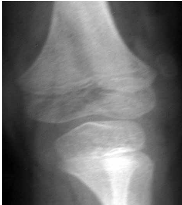
Fig. 2. — Radiograph of left knee of patient with Mulibrey Nanism syndrome with a dislocated left patella. Marked soft tissue contractures resulted in the external tibial torsion deformity seen in this true AP radiograph.

A 4-year-old girl with Mulibrey Nanism Syndrome, who had previously been successfully surgically treated at the age of 11 months for a left congenital vertical talus, presented with an increasing fixed flexion ( 15^\circ ), a valgus deformity of the left knee and an irreducible dislocation of the patella. Radiographs and CT scan (fig 2) confirmed a laterally dislocated patella. At the age of