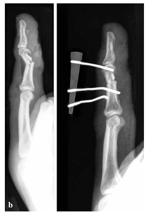
Fig. 3a-b. — Pre-operative (a) and post-operative (b) AP and lateral views of a fracture stabilised with K-wires and a plastic sheath