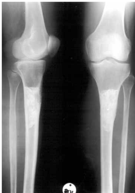
Fig. 1. — Radiographic appearance of HPC of the left tibia on admission.