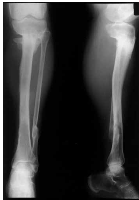
Fig. 4. — Twenty-six months after the initial operation and six months after bone grafting of the docking site, union occurred and the patient was free to fully weight-bear.

ator. Six months later union occurred and the patient was allowed full weight bearing (fig 4).