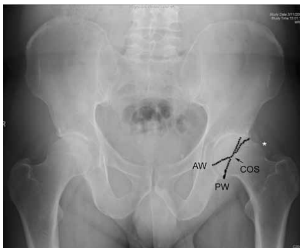
Fig. 1. — A standard AP radiograph of a patient with FAI related OA shows a cam-type deformity (asterix) as well as a positive cross over sign (COS) indicating a mixed-type FAI. PW : posterior acetabular wall ; AW : anterior acetabular wall.

described as the acetabular cause of FAI and is characterised by focal or general over-coverage of the femoral head resulting in early abutment with the femoral neck at the end-range of motion. Cam-type impingement is the femoral cause of FAI and is characterised by the presence of an a-spherical extrusion at the femoral head-neck junction with the potential of intrusion into the joint with subsequent risk of delamination and abrasion of the acetabular cartilage. Most patients have a combination of these two mechanisms (4) (Fig. 1) and the prevalence of these lesions has been reported to be as high as 17% (14).