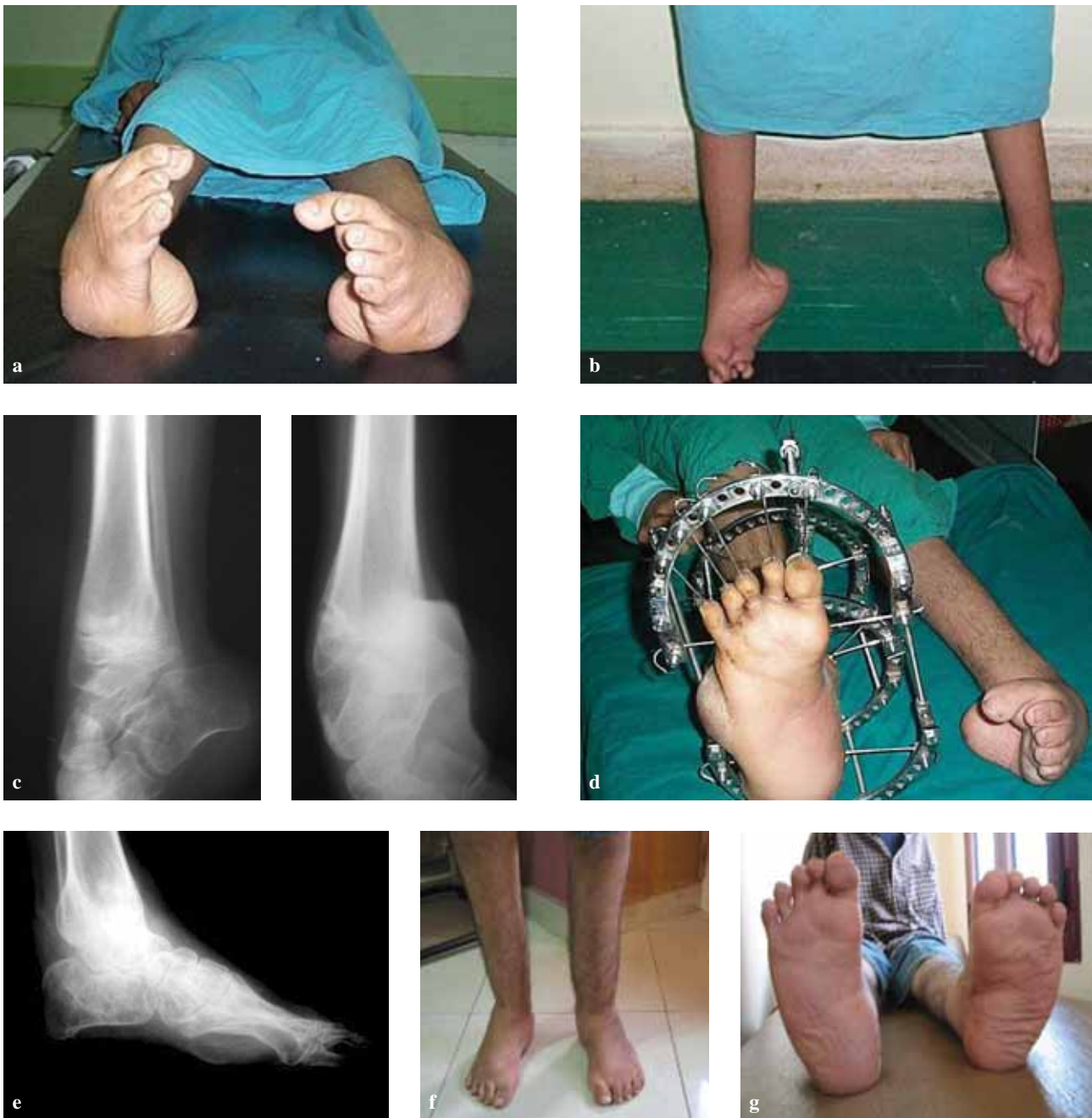
Fig. 3. — a and b) Preoperative appearance of the patient, c) Preoperative radiograph, d) Right side in the frame, e) Postoperative radiograph, f and g) After correction of both feet.

In 1993, Paley (12) reported on 25 complex foot deformities treated by Ilizarov distraction osteotomies. He used more than one type of osteotomy, such as supramalleolar, U, V, posterior calcaneal, talocalcaneal neck, midfoot, and