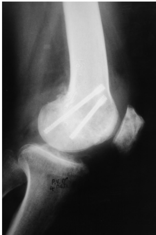
Fig. 7. — Follow-up after four months of B3 fracture treated with Herbert screws.

Even in those cases where nonsurgical treatment seems to be adequate, open reconstruction and rigid internal fixation are essential to promote quick healing, restore good function, ensure early mobilization and avoid late complications (7, 9, 10, 13).